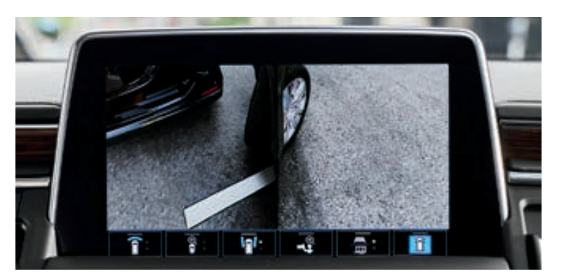
Front Side View Shows the position of the front tires when parking and during tight maneuvers.