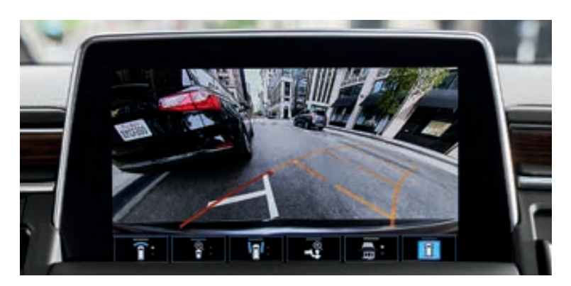
Front Camera View Displays a front view with available guidelines to assist with parking and tight maneuvers.