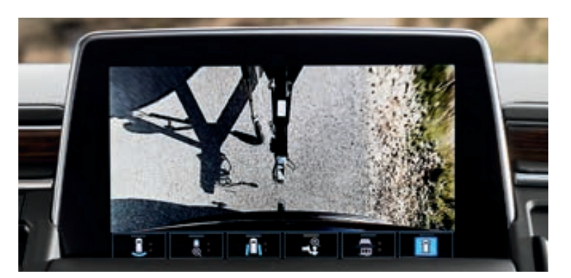
Hitch View Provides a close-up view of the receiver hitch to help with alignment when connecting to a trailer.