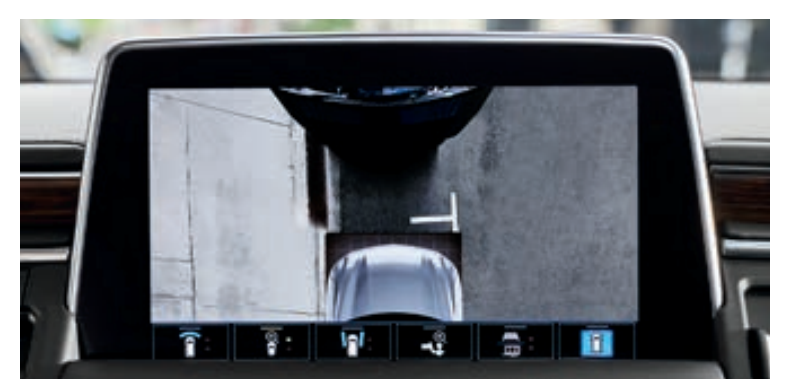
Front Top-Down View A top-down view of the hood, bumper and front tires for tight maneuvers in parking lots or along curbs.