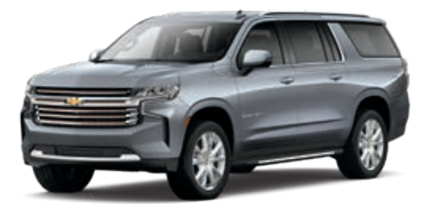
Satin Steel Metallic