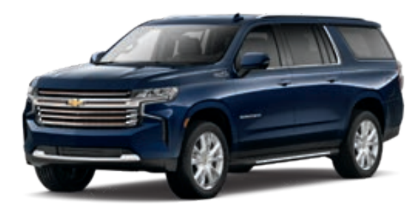
Midnight Blue Metallic