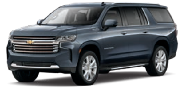
Shadow Gray Metallic