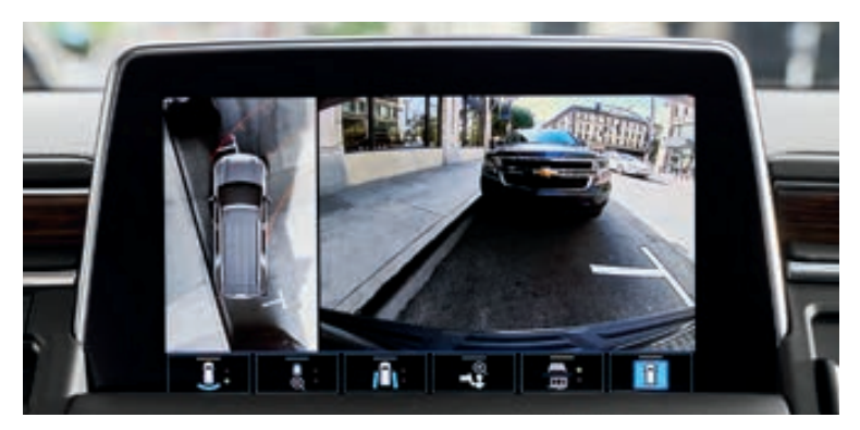
Surround View Gives a top-down bird's-eye view of the vehicle's surroundings.

Rear Camera Mirror An available dual-function camera-based rearview mirror provides a wider, less-obstructed field of view than a traditional rearview mirror.