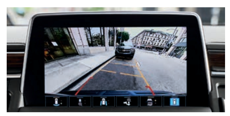
Rear Camera View Displays a rear view to assist with parking and tight maneuvers.