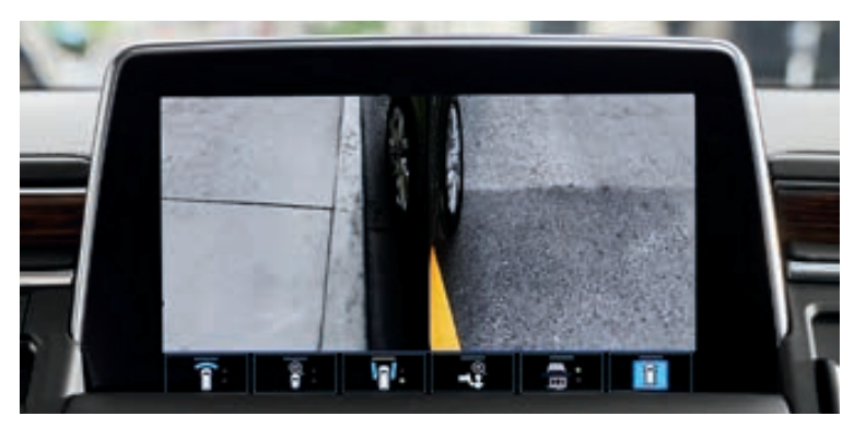
Rear Side View Provides a line of sight down each side of the vehicle.