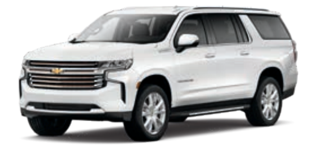
Iridescent Pearl Tricoat<sup>1,2</sup>