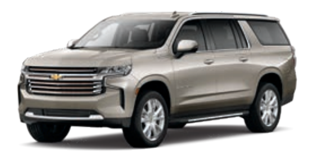
Empire Beige Metallic