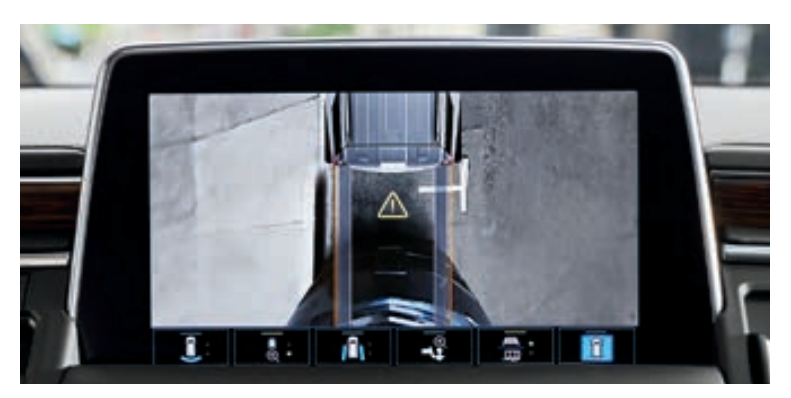
Rear Top-Down View Shows the clearance between the rear of the vehicle and nearby objects.