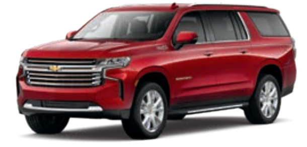
Cherry Red Tintcoat<sup>1</sup>