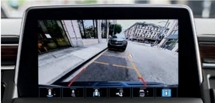
Rear Camera View Displays a rear view to assist with parking and tight maneuvers.