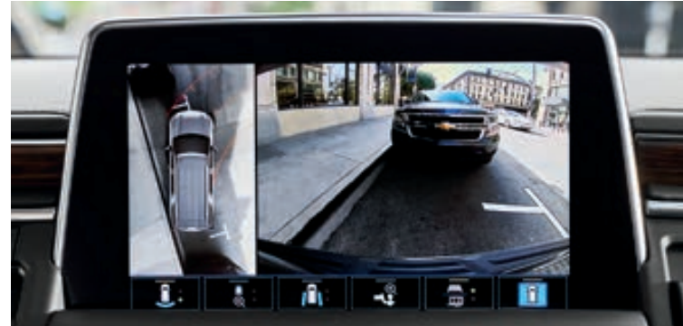
Surround View Gives a top-down bird's-eye view of the vehicle's surroundings.