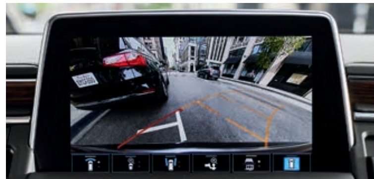
Front Camera View Displays a front view with available guidelines to assist with parking and tight maneuvers.