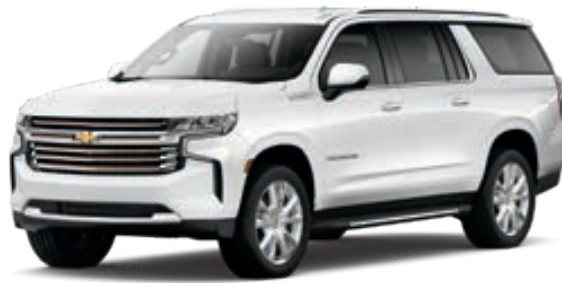
Iridescent Pearl Tricoat 1,2