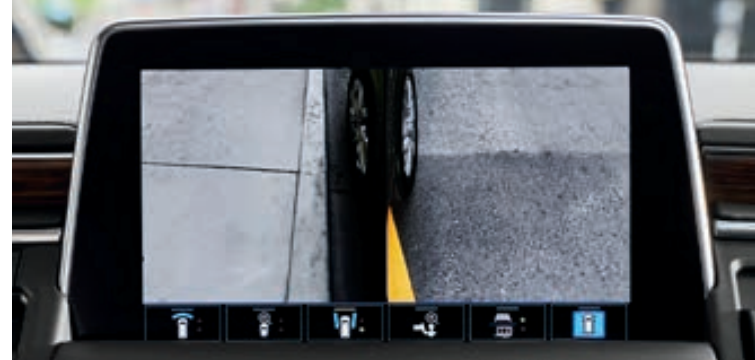
Rear Side View Provides a line of sight down each side of the vehicle.