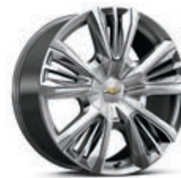
22" Sterling Silver-Painted Aluminum Wheels with Chrome Inserts (RPT) with Wheel Locks Standard on High Country

HD Surround Vision 1 – includes HD Rear Vision Camera 1