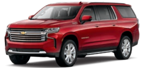
Cherry Red Tintcoat 1