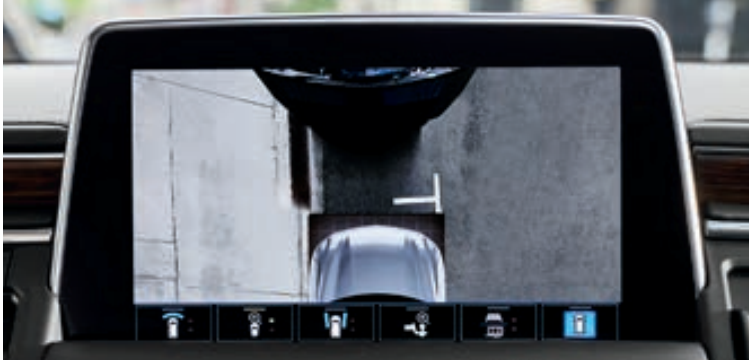
Front Top-Down View A top-down view of the hood, bumper and front tires for tight maneuvers in parking lots or along curbs.