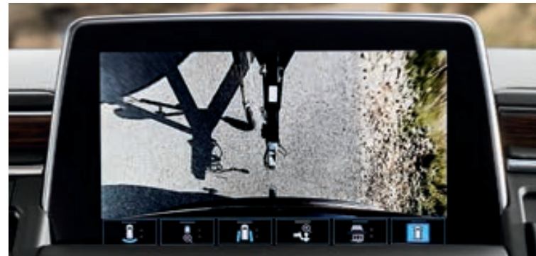
Hitch View Provides a close-up view of the receiver hitch to help with alignment when connecting to a trailer.