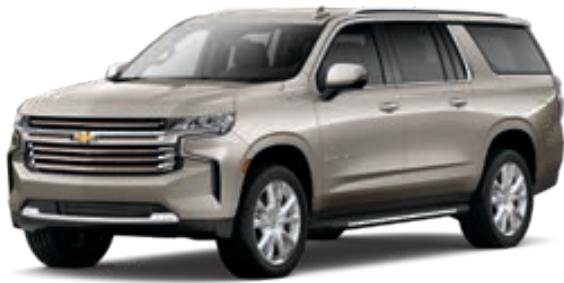
Empire Beige Metallic