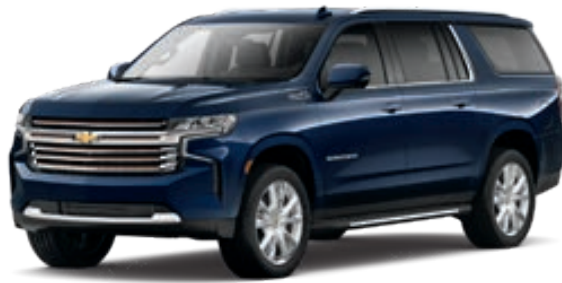
Midnight Blue Metallic