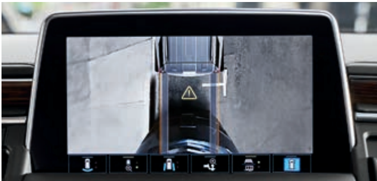
Rear Top-Down View Shows the clearance between the rear of the vehicle and nearby objects.