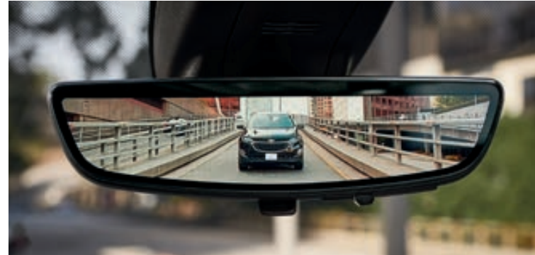
Rear Camera Mirror An available dual-function camera-based rearview mirror provides a wider, less-obstructed field of view than a traditional rearview mirror.