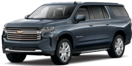
Shadow Gray Metallic