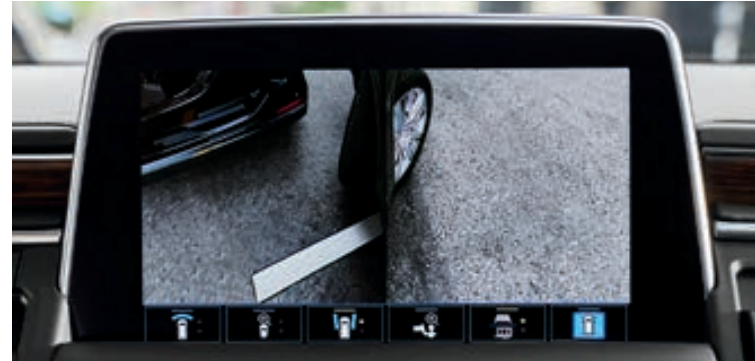
Front Side View Shows the position of the front tires when parking and during tight maneuvers.