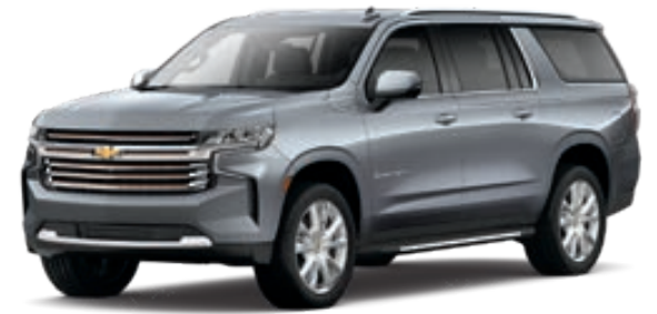
Satin Steel Metallic