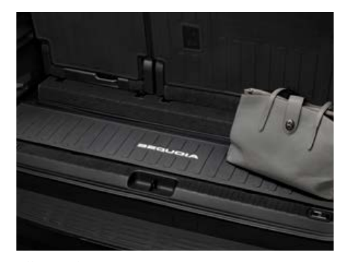
All-weather cargo mat<sup>7</sup>

This is a great way to add extra personality to your Sequoia. Not every accessory is available in your area, so for a complete list of accessories, go to toyota.com/sequoia/accessories.