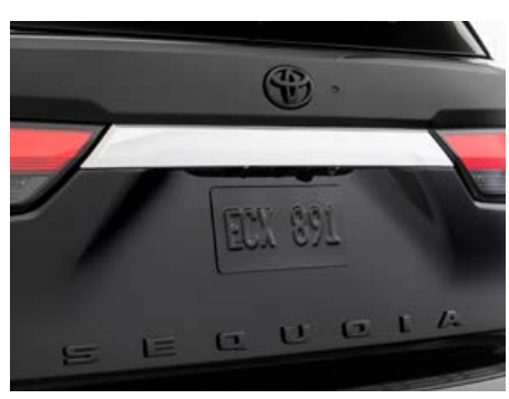
Black emblem overlay