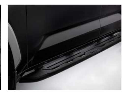
TRD cast-aluminum running boards