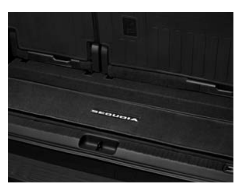
Carpet cargo mat<sup>7</sup>