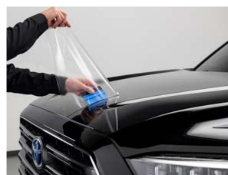
Paint protection film<sup>64</sup>