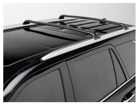
Cargo cross bars