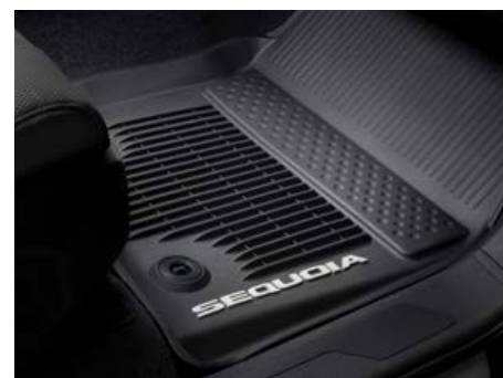
All-weather floor liners51