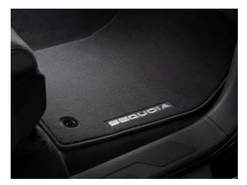
Carpet floor mat<sup>51</sup>