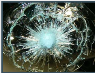
Anti-Spall Anti-spall layer prevents glass fragments from penetrating into passenger cabin