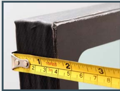
Glass Thickness 40 mm thick glass/polycarbonate

C. All original glass is removed & replaced with NIJ certified multi-layered ballistic glass/polycarbonate