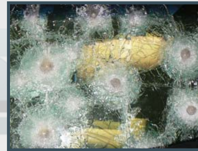
Multi-hit Protection All windows are capable of sustaining multiple hits while providing protection to passengers