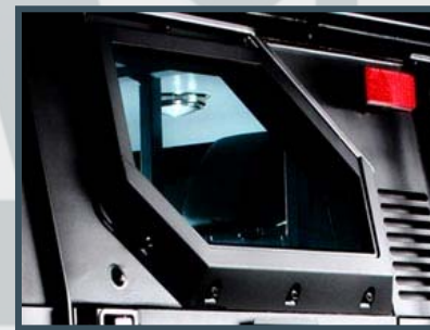
Anchored Windows All ballistic windows are anchored using ballistic steel cases