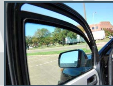
Power Windows Lowers approx. 5 inches