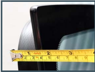
Glass Thickness 40 mm thick glass/polycarbonate

C. All original glass is removed & replaced with NIJ certified multi-layered ballistic glass/polycarbonate