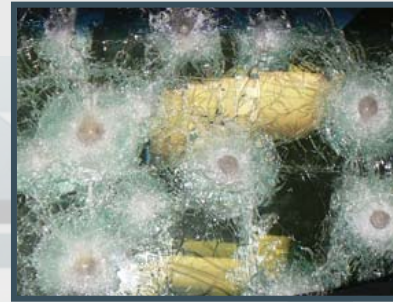
Multi-hit Protection All windows are capable of sustaining multiple hits while providing protection to passengers