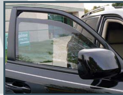
Power Windows Lowers approx. 5 inches