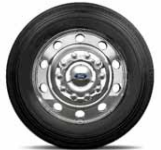
Polished Aluminum with Optional Wheel Ornamentation (front)