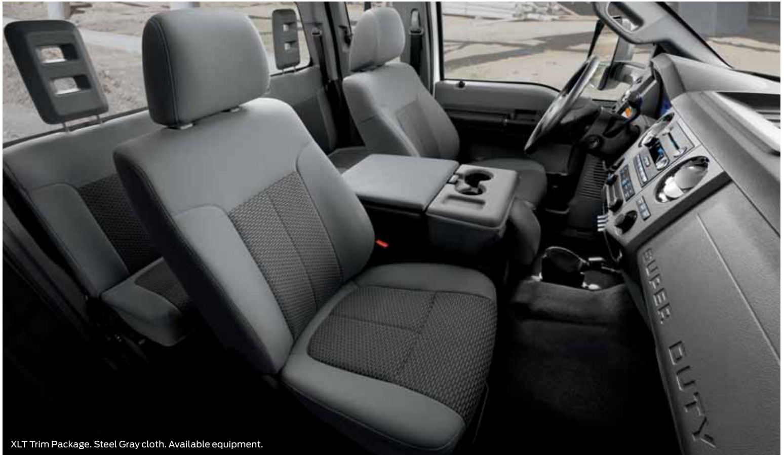
XLT Trim Package. Steel Gray cloth. Available equipment.