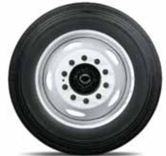
White Powder-Coated Steel (front)