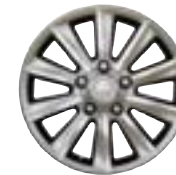
20-in 10-spoke Liquid Graphite-finished alloy wheels 26 AVAILABLE