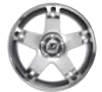
22-in F Sport™ five-spoke forged alloy wheels 27,28,29 AVAILABLE