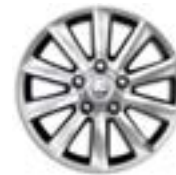
20-in 10-spoke alloy wheels 26 STANDARD