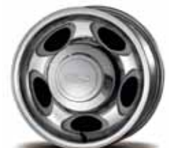
16-in. Aluminum Wheels Available