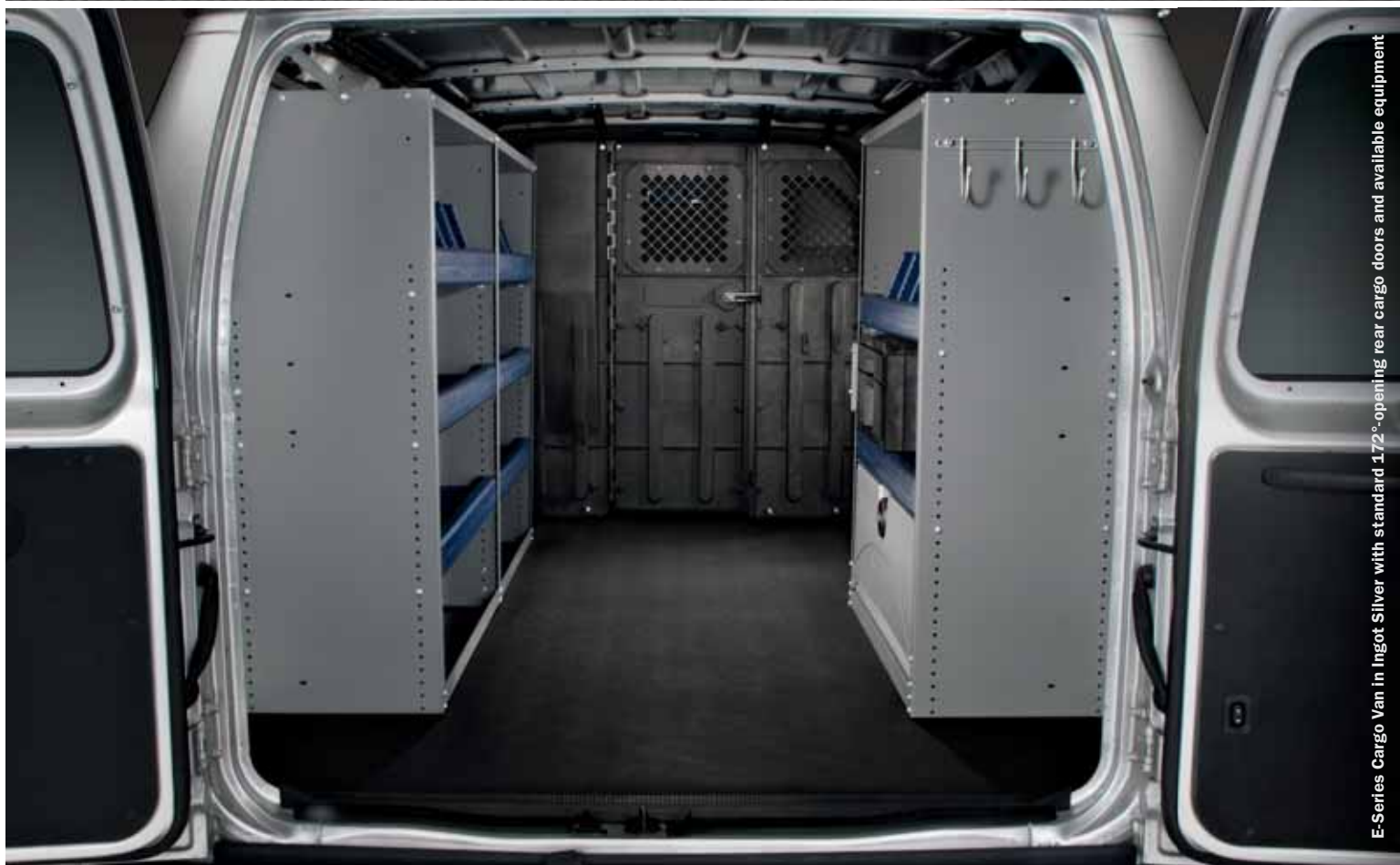
E-Series Cargo Van in Ingot Silver with standard 172°-opening rear cargo doors and available equipment

A wide range of available STORAGE SOLUTIONS by Masterack® can help keep you organized. There's the QUIETFLEX® COMPOSITE racks and bins package, the rugged MASTERACK® STEEL racks and bins package, and the ECONOCARGO® Cargo Management System – all AVAILABLE AT NO EXTRA CHARGE ¹