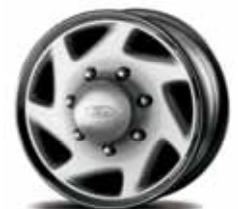
16-in. Steel Wheels with Sport Wheel Covers Standard

Power Code is a trademark of Code Systems, Inc.