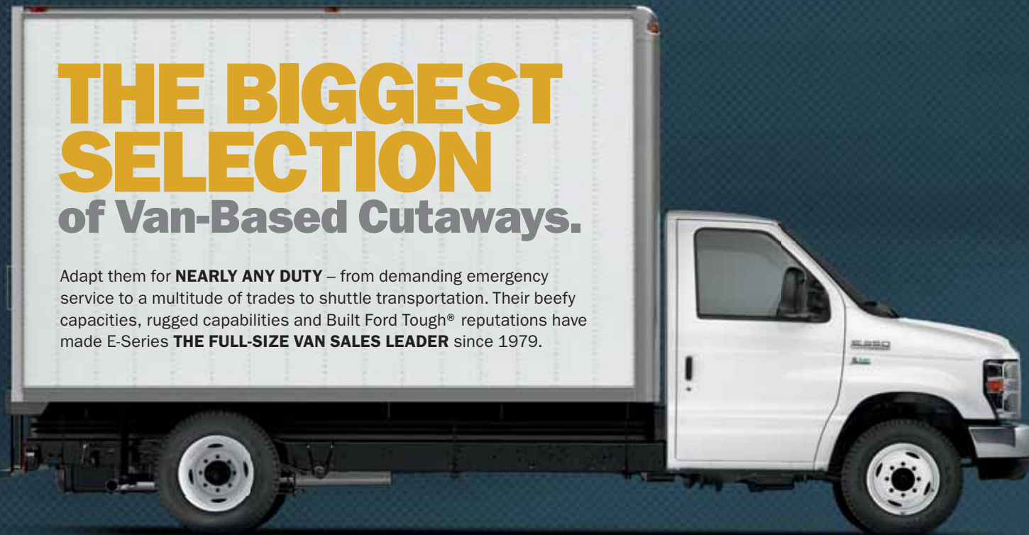
E-350 Cutaway in Oxford White with aftermarket Cube Van Upfit and available equipment

Adapt them for NEARLY ANY DUTY – from demanding emergency service to a multitude of trades to shuttle transportation. Their beefy capacities, rugged capabilities and Built Ford Tough® reputations have made E-Series THE FULL-SIZE VAN SALES LEADER since 1979.