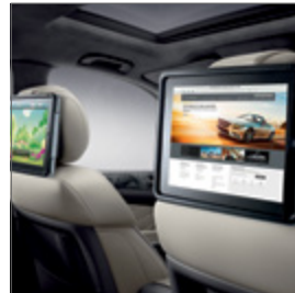
iPad® 2/iPad® 4 Docking station Plus