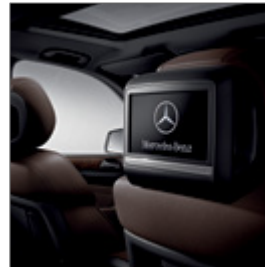
Rear Seat Entertainment System, kit matt black / almond beige / alpaca grey