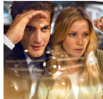
› Mercedes me inspire