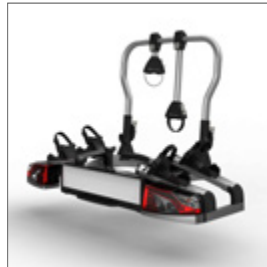
Rear-mounted bicycle rack