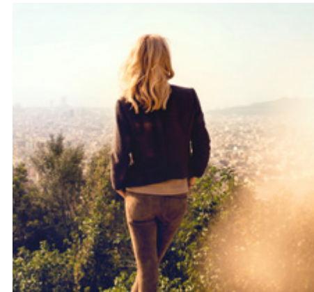
› Mercedes me move