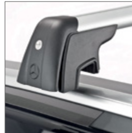
Basic carrier bars for roof rails