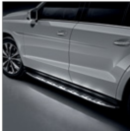
Illuminated running boards