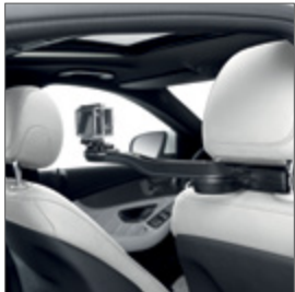
Action cam mount Base set is required

For more detailed accessories click here: Mercedes-Benz Genuine Accessories