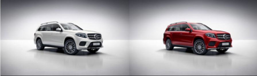
designo Diamond White Bright