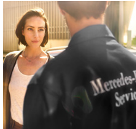
› Mercedes me assist