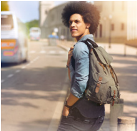
› Mercedes me connect

Mercedes me is your package of innovative services, products and lifestyle offers from Mercedes-Benz, Daimler and our cooperation partners – including access to your vehicle via smartphone, of course. Your personalised homepage covers the individual topics relevant to you. Whether entertainment, travel or lifestyle: registering with Mercedes me gives you access to exclusive life-enhancing offers. Anytime and anywhere.