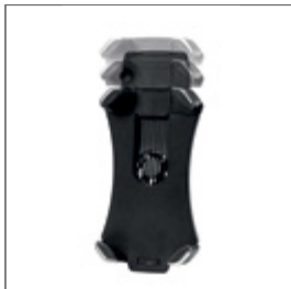
Universal smartphone holder