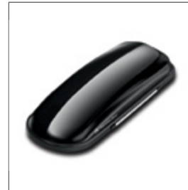
Mercedes-Benz roof box 400l, opens on both sides