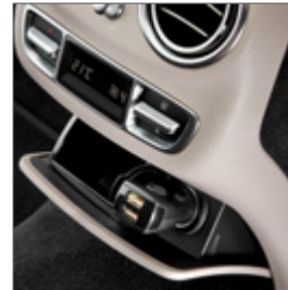
USB power charger, with gift packaging