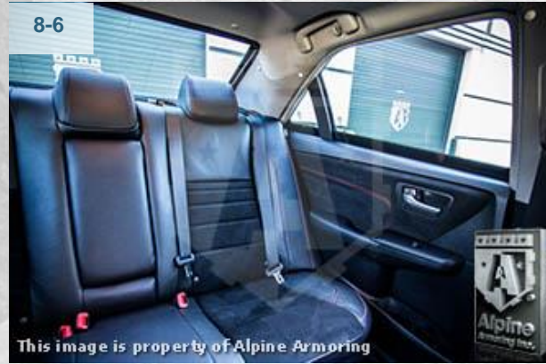
This image is property of Alpine Armoring