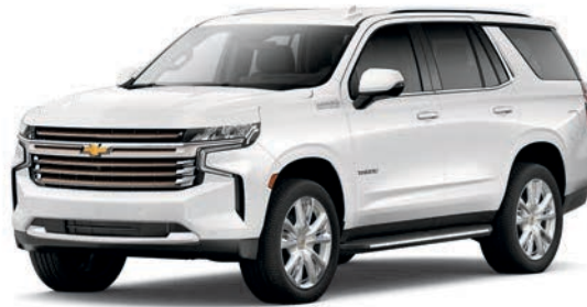
Iridescent Pearl Tricoat 1,2