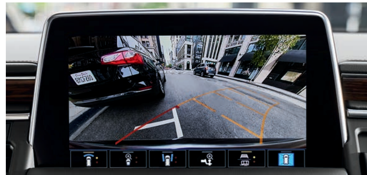
Front Camera View Displays a front view with available guidelines to assist with parking and tight maneuvers.