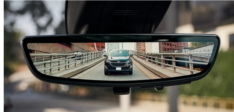
Rear Camera Mirror An available dual-function camera-based rearview mirror provides a wider, less-obstructed field of view than a traditional rearview mirror.