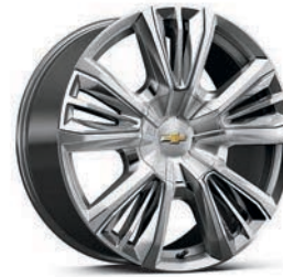
22" Sterling Silver-Painted Aluminum Wheels with Chrome Inserts (RPT) with Wheel Locks Standard on High Country

HIGH COUNTRY In addition to or replacing Premier features, High Country includes: