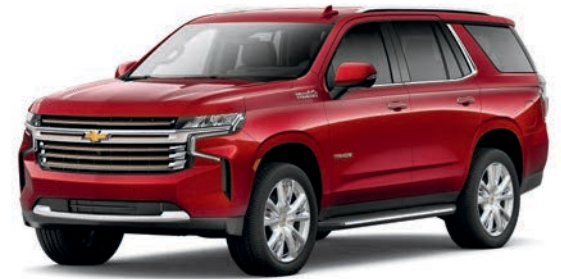
Cherry Red Tintcoat 1