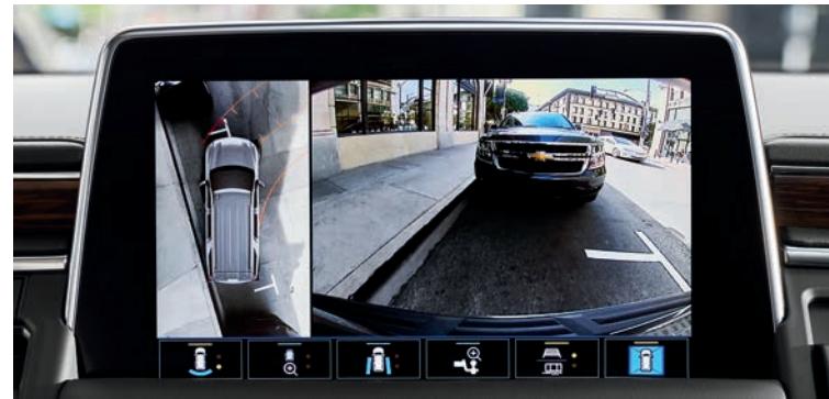
Surround View Gives a top-down bird's-eye view of the vehicle's surroundings.