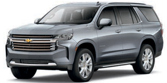
Satin Steel Metallic