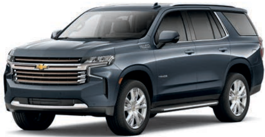
Shadow Gray Metallic