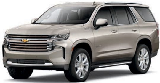
Empire Beige Metallic