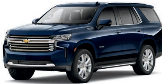
Midnight Blue Metallic